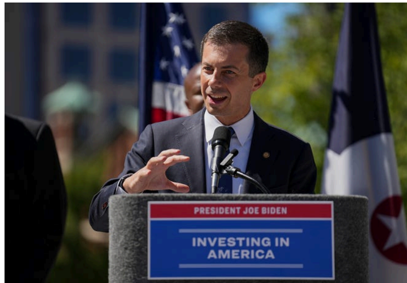
Secretary of Transportation, Pete Buttigieg

Whether you professionally work in the transportation sector or not. All of us have so much to say, because all of us depend on being able to move around to get through life."